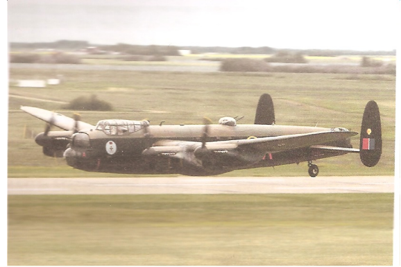
A Lancaster low pass at Saskatoon airport 26 Oct 09 - see story below: