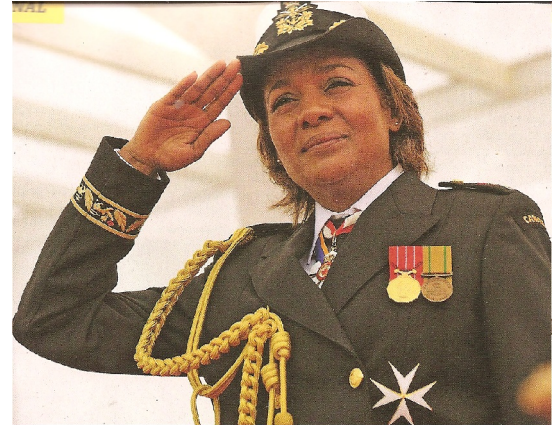
Governor-General and Commander-in-Chief Michaëlle Jean