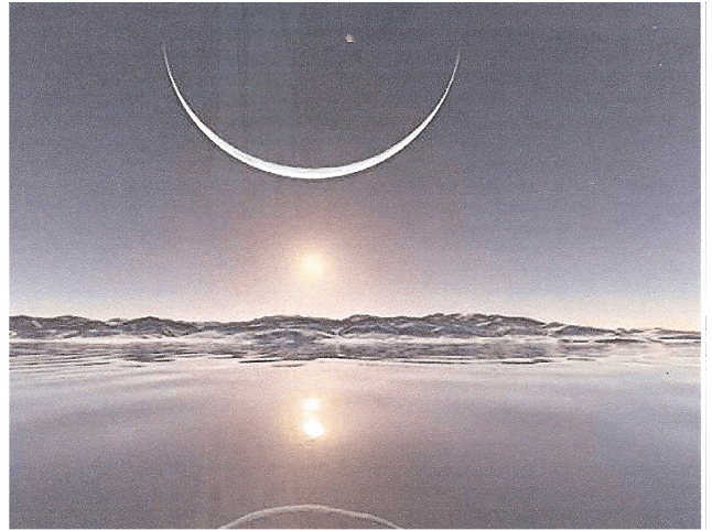
The Sun returns to the North Pole, with the Sun below the Moon February 2009.