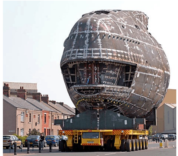
And, this is just HMS Astute's bow - See page 3